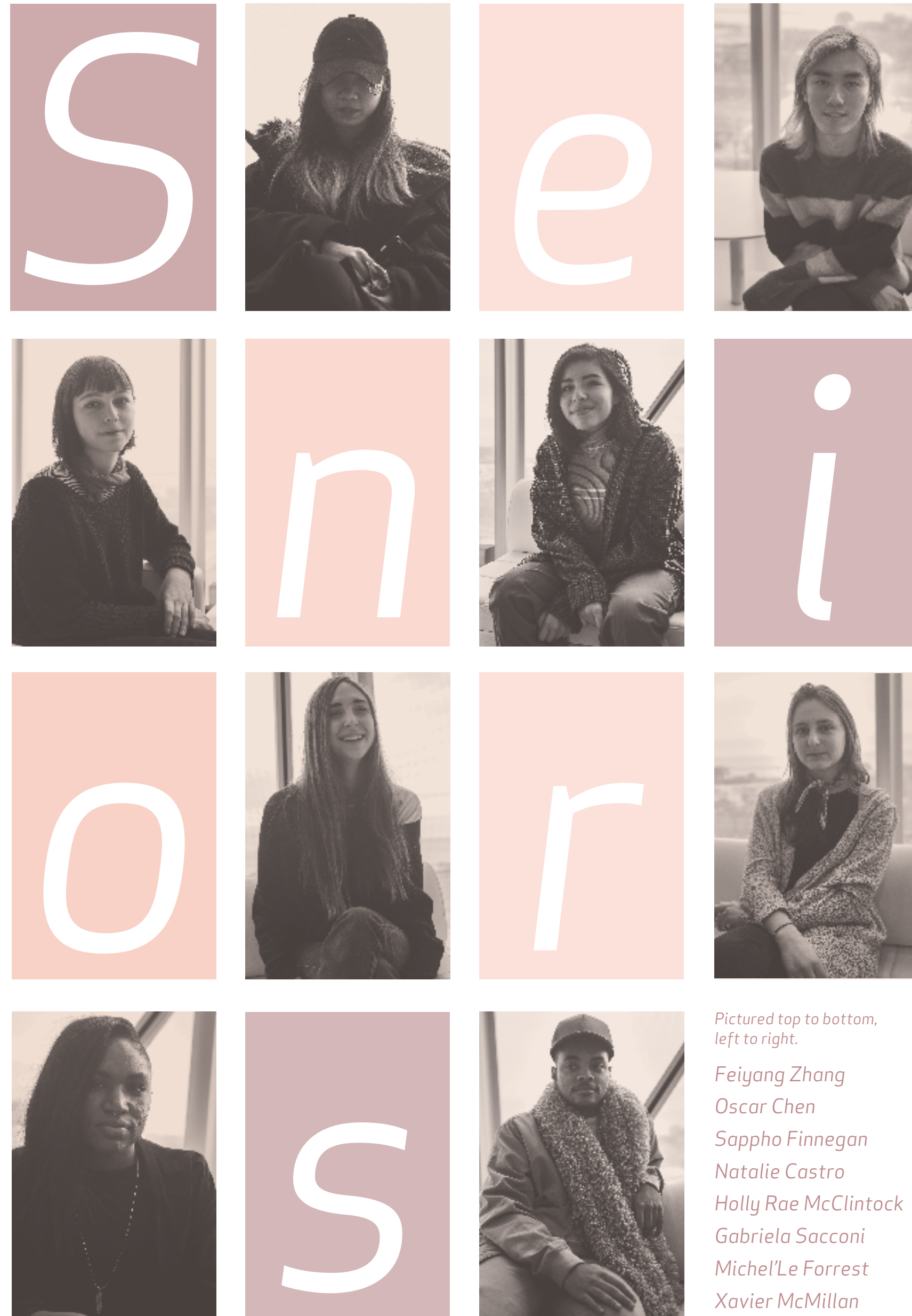
Pictured top to bottom, left to right.