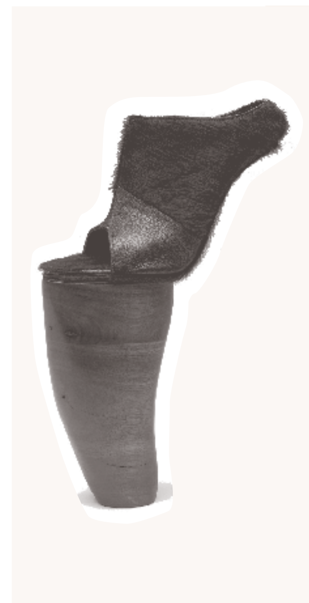
DESIGN Sangyeon Park (BFA 2017) PHOTO Lanting Qu (BFA 2018)