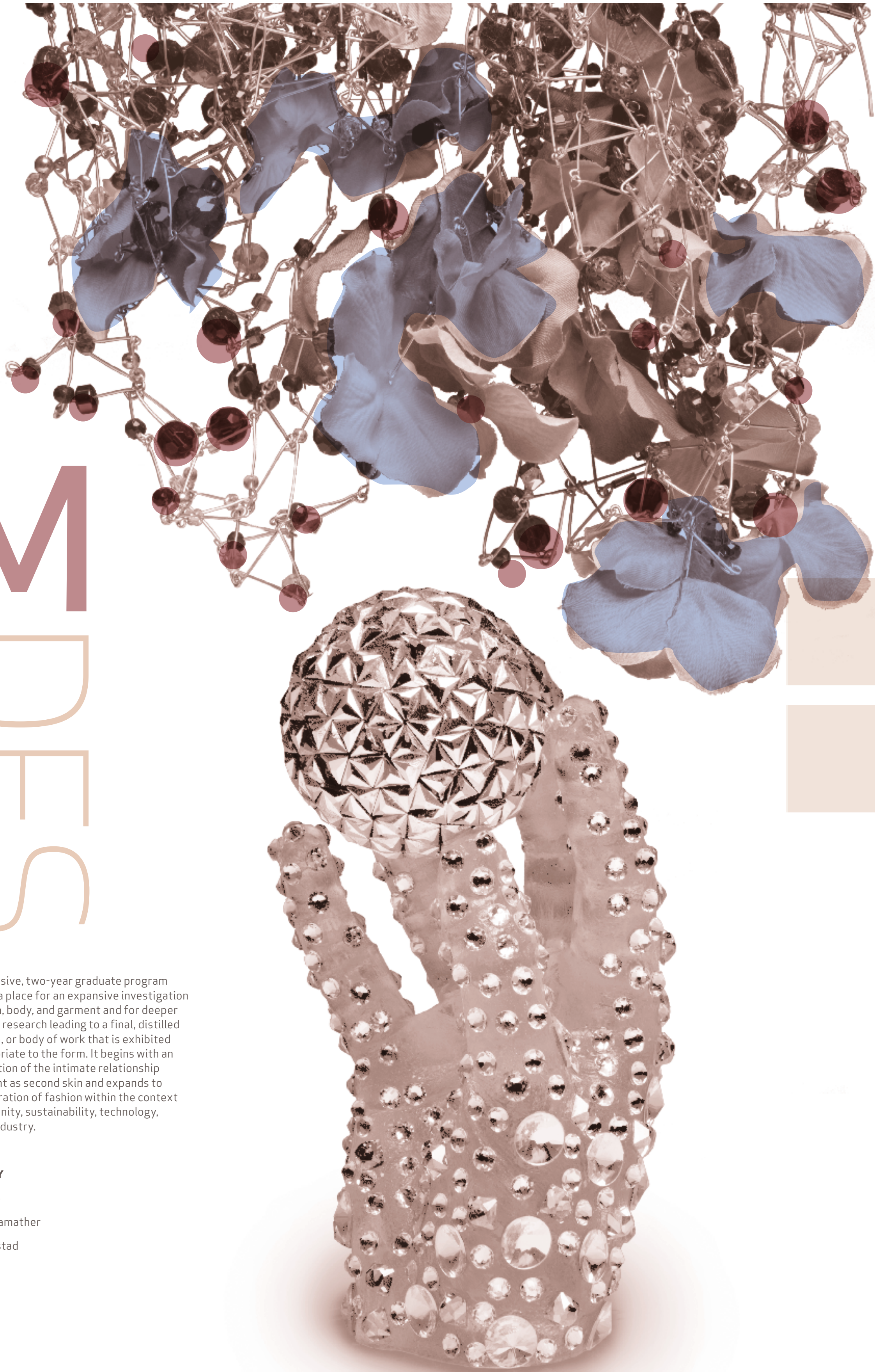
eresen Nelson Cantada (MDes 2017)