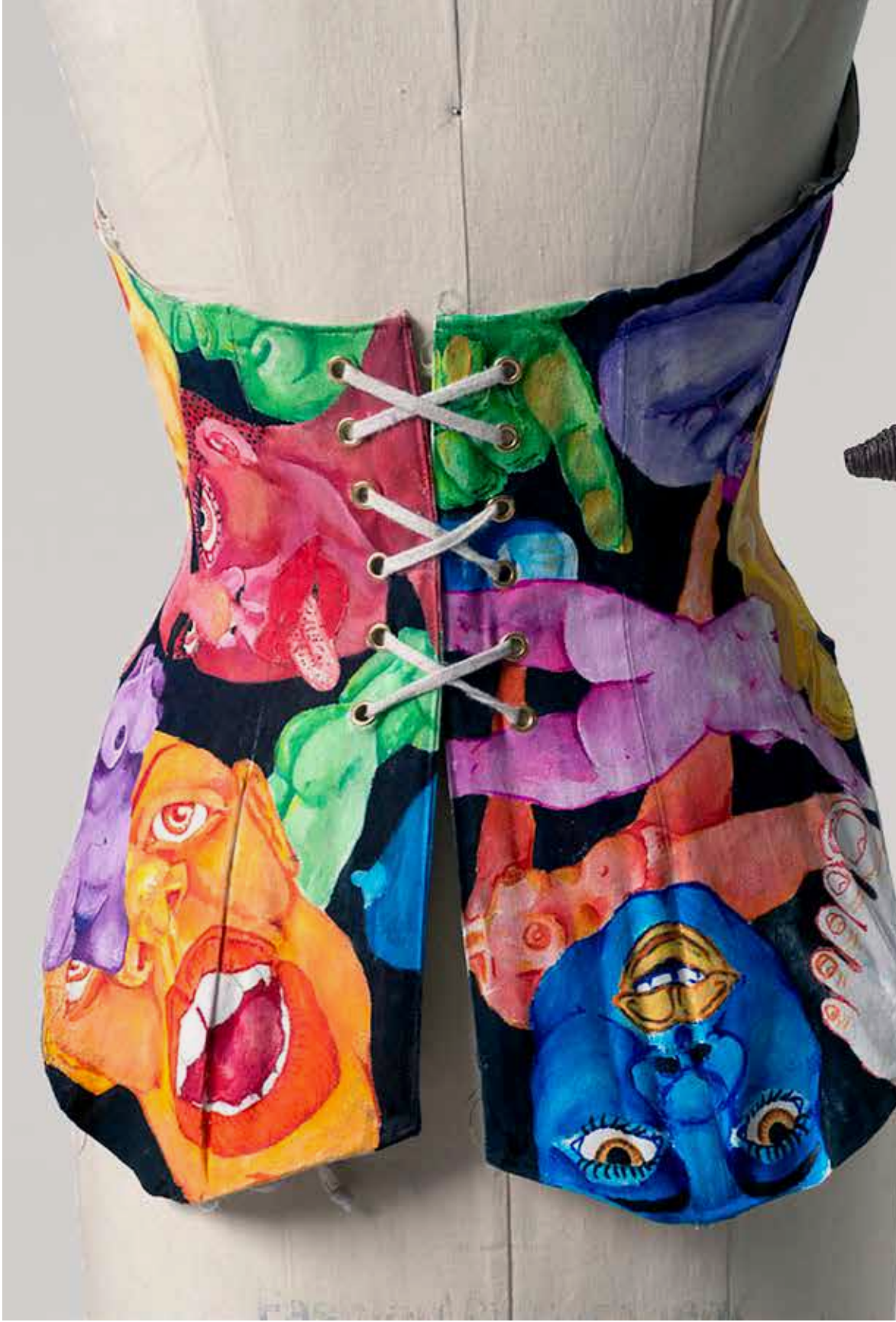
#SarahWisnom #SAICFashion2018 #SAICFashion #ShapingTheFemaleForm #Corsetry #SAICBodyBuilder #JamesPrinzPhotography