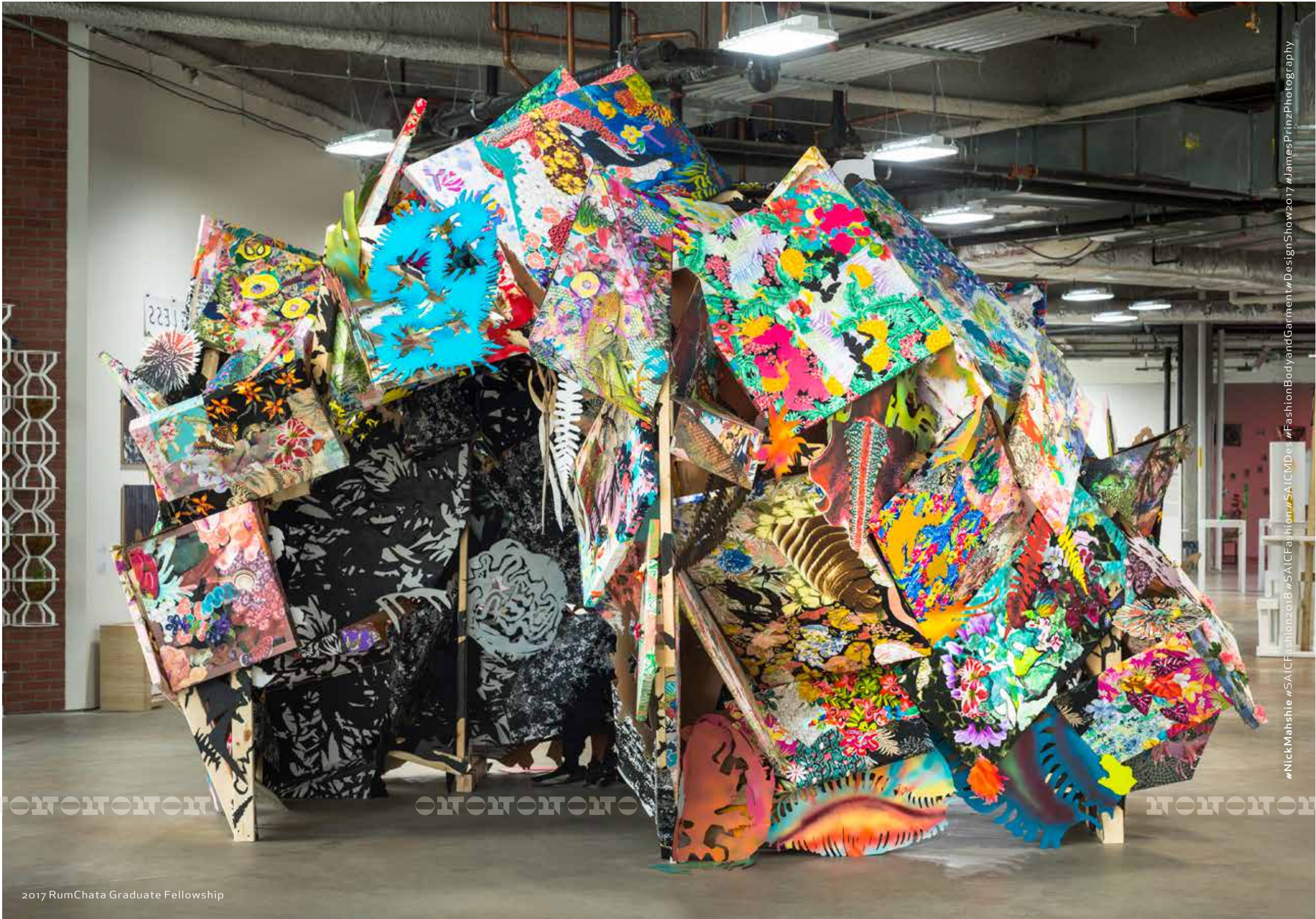
2017 RumChata Graduate Fellowship