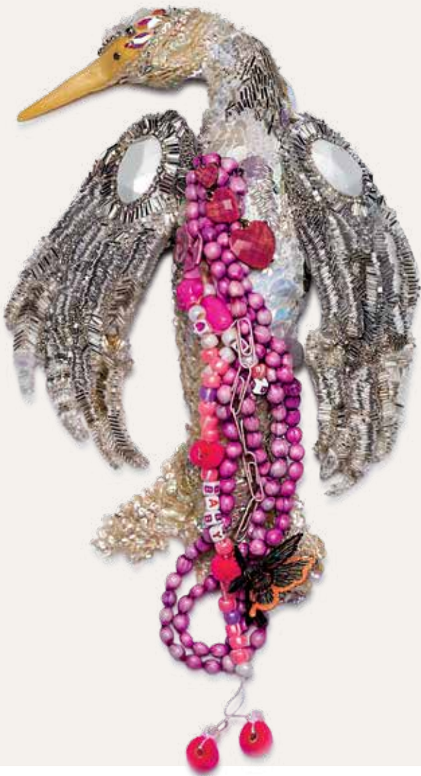
#PageBurow #SAICFashion2018 #SAICFashion #SupplyAndSurplus #SAICBodyBuilder #JulianSpring