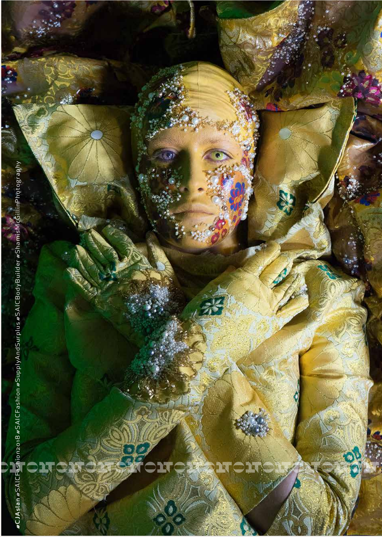
#CJAsian #SAICFashion2018 #SAICFashion #SupplyAndSurplus #SAICBodyBuilder #ShamisMcGillPhotography