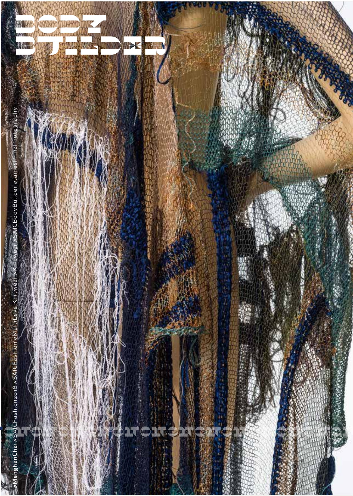
#MenghanChat #SAICFashion2018 #SAICFashion #MultiLevelKnitWear #KnitWear #SAICBodyBuilder #JamesPrinzPhotography