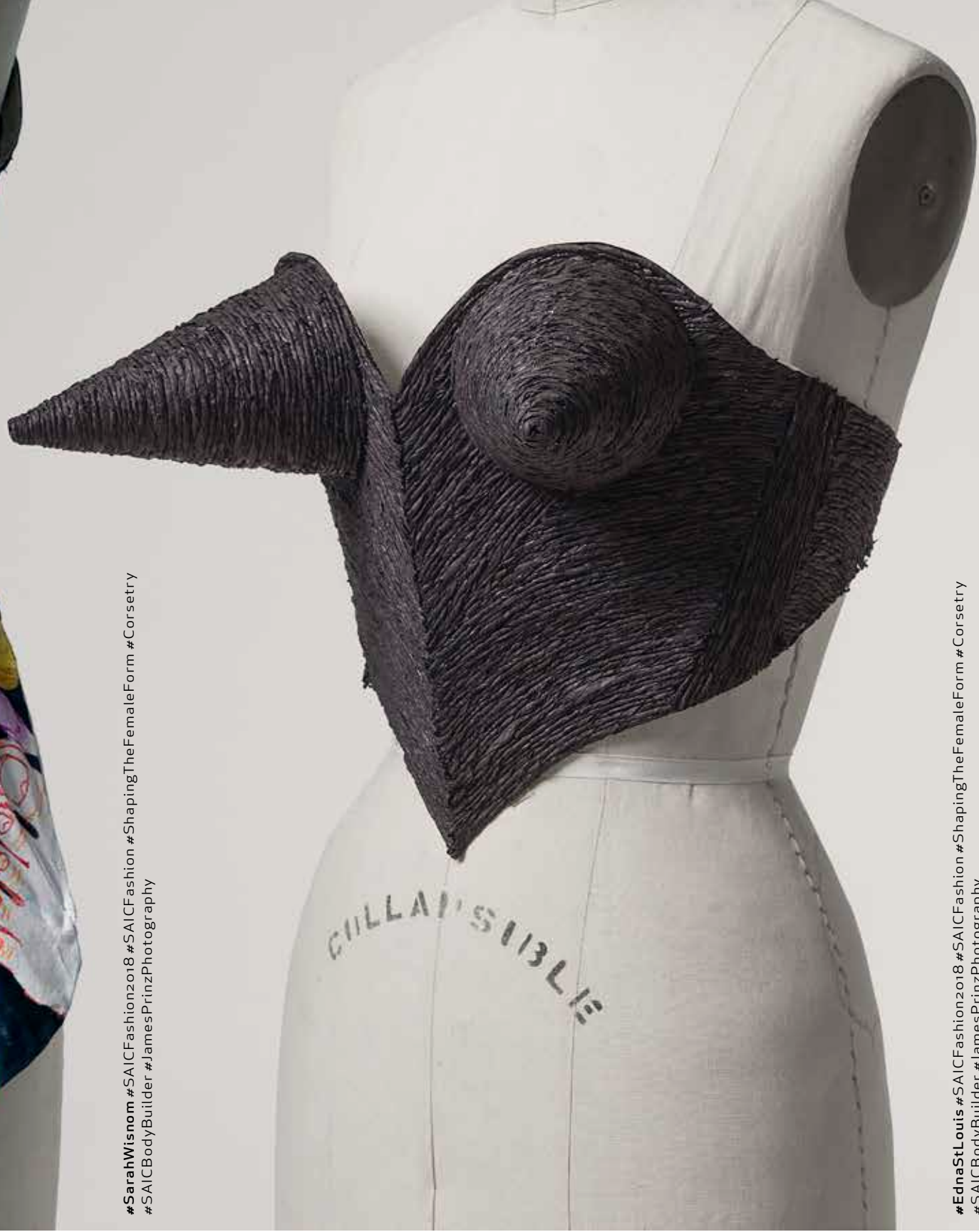
#EdnaStLouis #SAICFashion2018 #SAICFashion #ShapingTheFemaleForm #Corsetry #SAICBodyBuilder